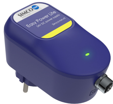
Easy Power Lite: 110-230V (EU)