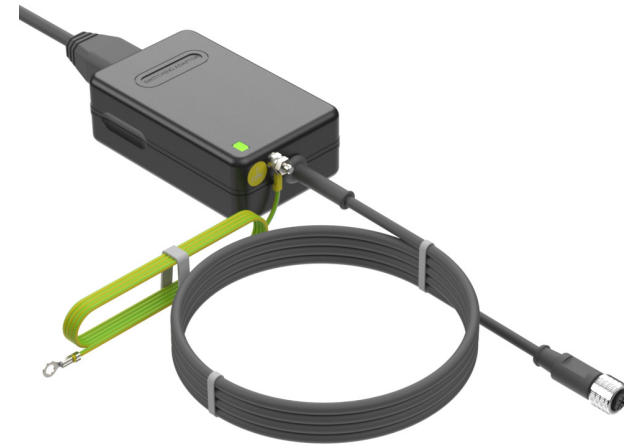
Desktop 110-230V (NON EU)